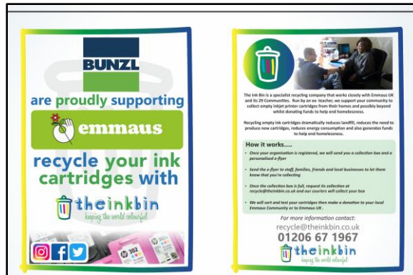
Flyers to promote your work with your customers