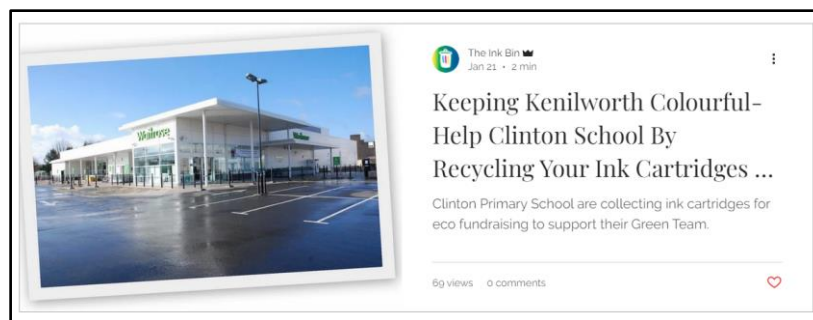
Blogs which we can use for targeted advertising